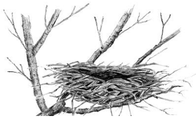
Artwork by Catherine Clark

Haiku: Newly discovered behind the dropping hedge leaves: -an old empty nest